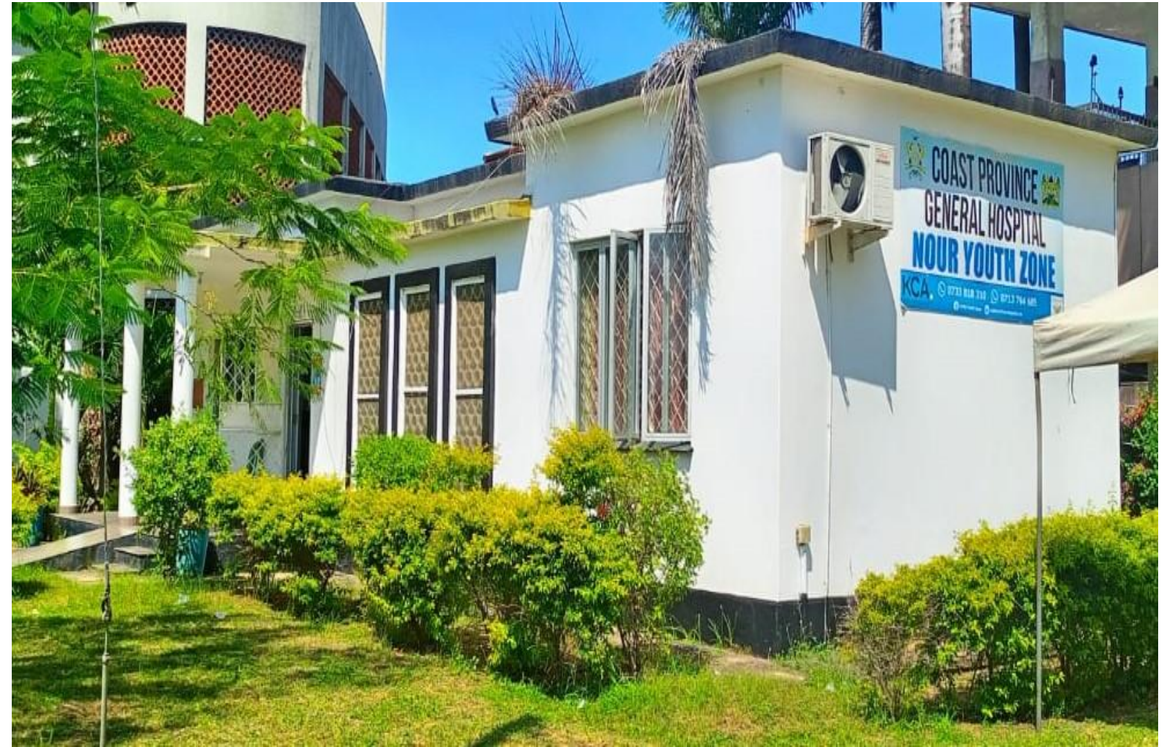
The Youth Zone is a stand alone unit located within Coast General Teaching and Referral Hospital